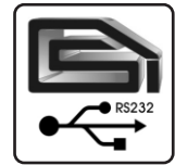
ES601 Plus System Connectivity

1% of Reading Accuracy Compatible with Pulsatile Flow Pumps