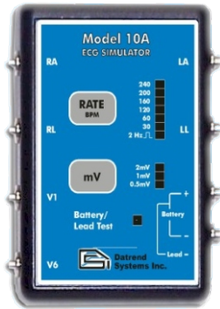
8000-450 Model 10A ECG Simulator